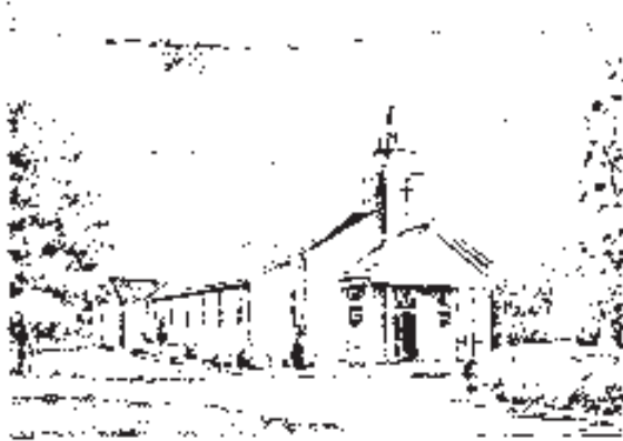
Immaculate Conception 20916 Dalton Road, Box 128, Sutton West, ON L0E 1R0 parish@immaculateconception.on.ca